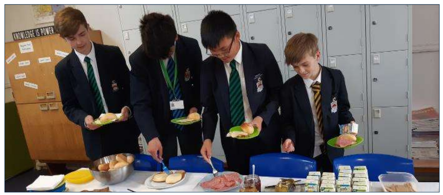
Year 9 GCSE German pupils enjoying a German breakfast earlier this month!