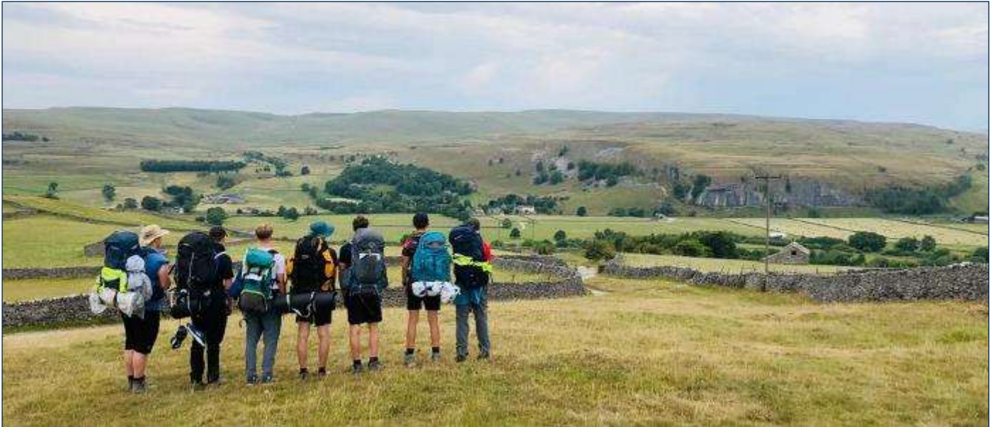
DoE Expedition, July 2023