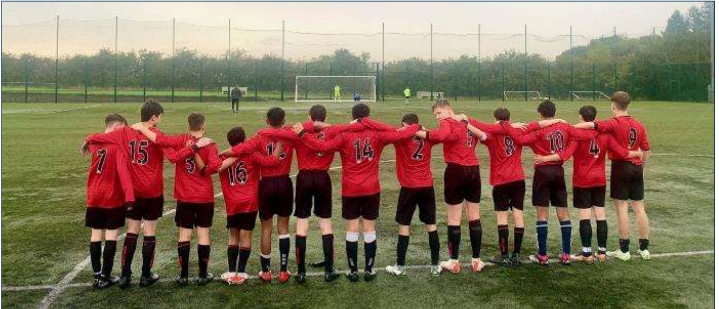
Year 10 football team against Malton School, September 2023