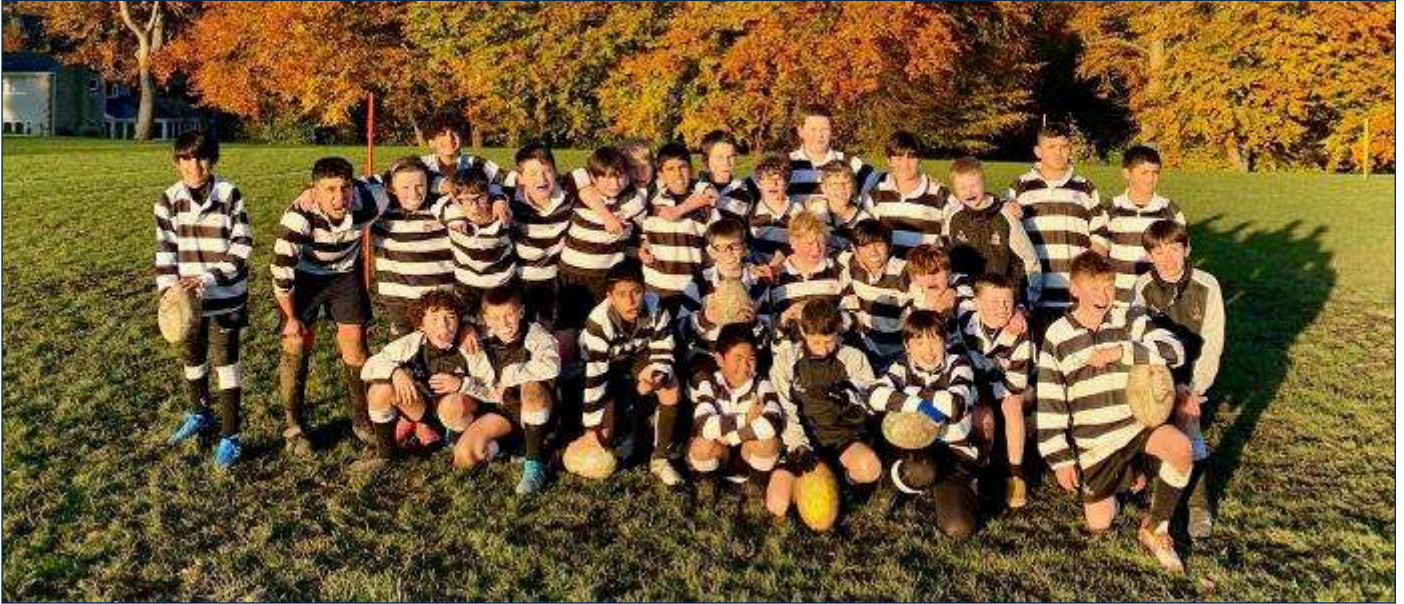
7E after their second rugby lesson, November 2023