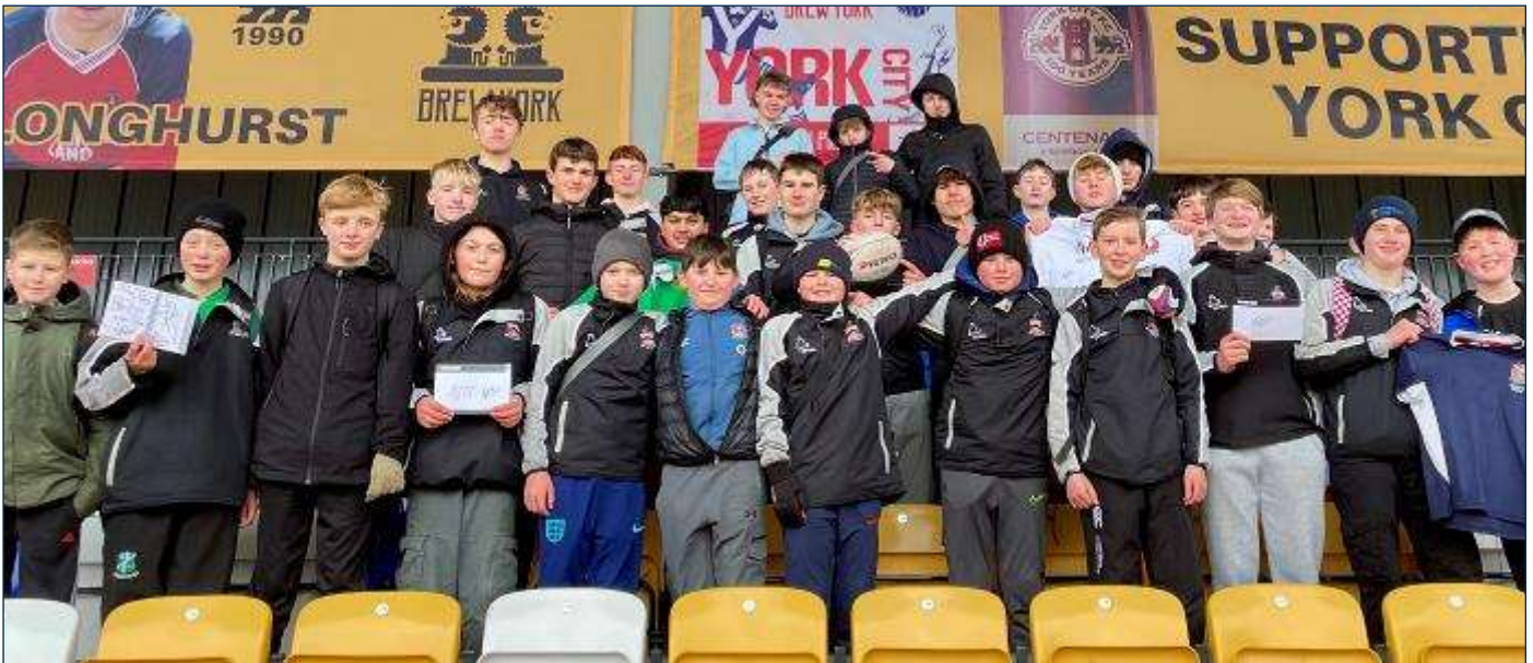
Pupils attend an England Rugby Union Men's Team Open Training Session, March 2024